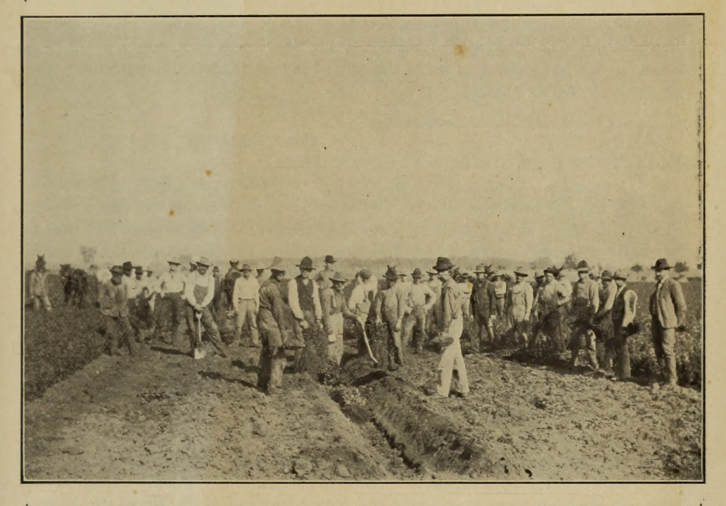
Digging Apple Seedlings in Our New Plant at Rossville, Kansas, Showing Our "Follow Up" System of Heeling Right After Pulling -No Exposure in Digging This Way.

Impaired Vitality in Apple Seedling may not be apparent; you get the results in your stand of grafts. Do your grafts ever throw out a few sickly leaves and then die? If you examined the roots, you have been surprised to find they have not started tho' plump and sound. Impaired Vitality! Have you ever attributed this lack of vitality to exposure in digging and handling the seedlings, and to the kind of soil on which they are grown?